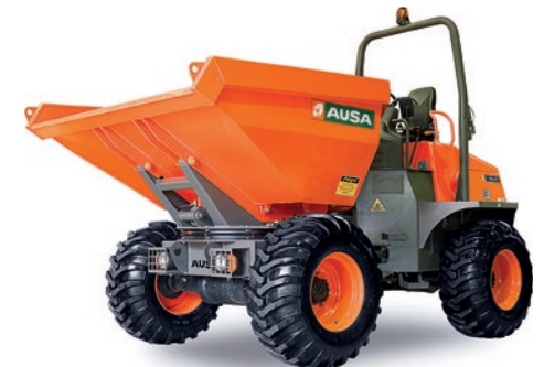
D 1000 A