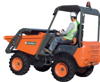
D 201 R

1.500 / 1.750 kg Front, swivel, high tipping skip Self loading bucket