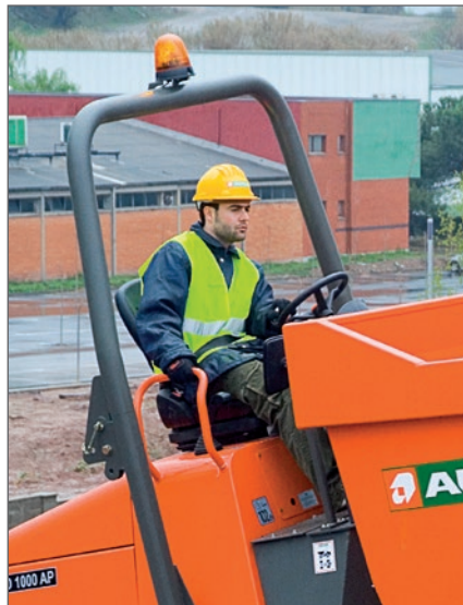
Driving site with folding FOPS structure