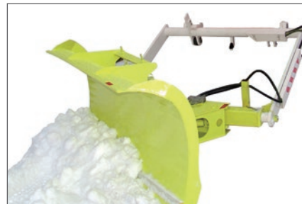
Snow blade (BD 120/202)