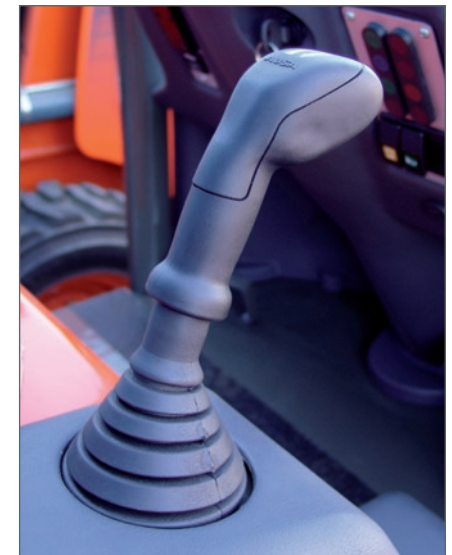
Total control joystick