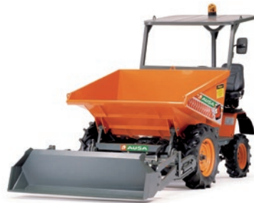
D 150/175 R

1.500 / 1.750 kg Front, swivel, high tipping skip Self loading bucket