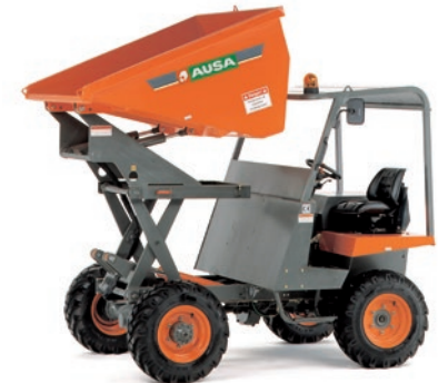
D 250/300 R

2.000 Kg Front, swivel tipping skip Self loading bucket