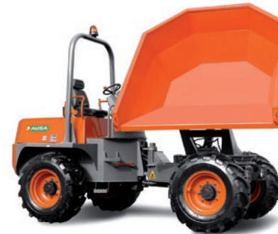
D 600 A

2.500 / 3.500 / 4.000 kg Swivel, high tipping skip