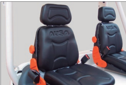
Passenger seat (D 201/250/300 R)