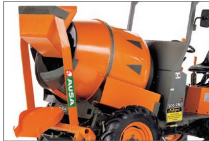
Mixer (X 500/1100 R)