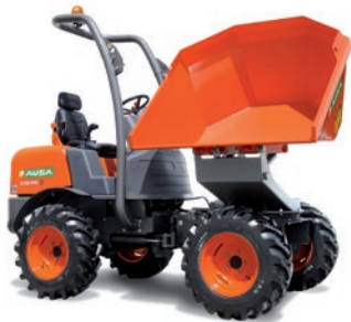
D 100/120/150 A

1.000 / 1.200 / 1.500 kg Swivel, high tipping skip