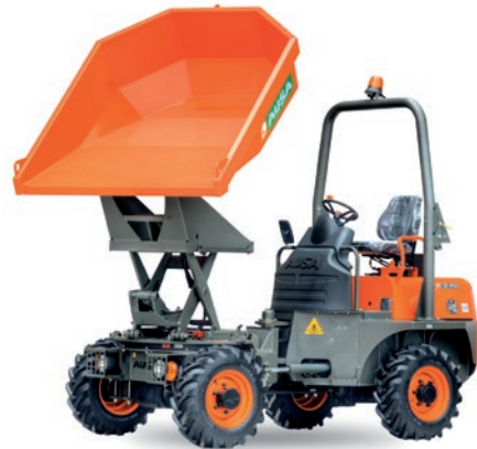
D 250/350/400 A

1.000 / 1.200 / 1.500 kg Swivel, high tipping skip