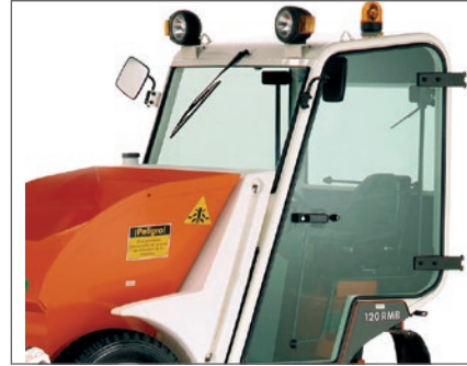
Sound-proof and ROPS/FOPS closed cabin (D 150/175 R, D 201 R & D 600/1000 A)